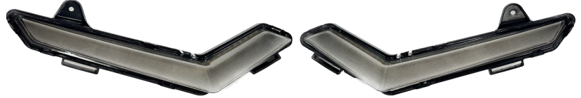
(1) - LH Accent Light